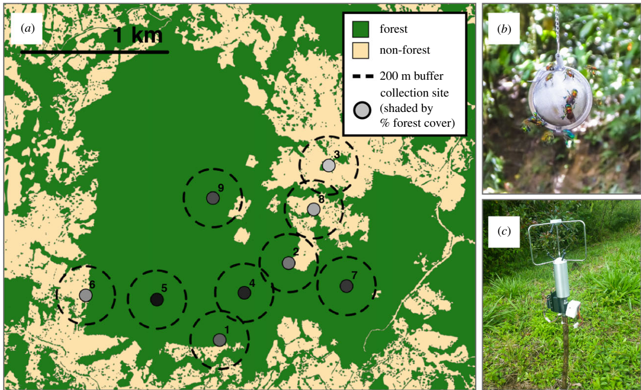
Figure 1. Study area and methods. (a) Map of collection sites ( N = 9 ) at Las Cruces Biological Station, Puntarenas Province, Costa Rica. Solid markers show collection site (with shade indicating average percentage of local forest cover), and dotted lines show buffer zones used for measuring forest cover (radius = 200 m). (b) Male orchid bees visiting a scent bait. (c) Three-dimensional sonic anemometer deployed in the field.